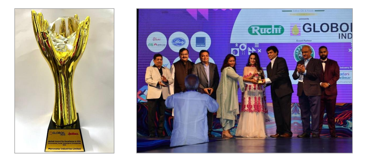
GLOBOIL INDIA 2021 Awards Ceremony & Conference at Goa